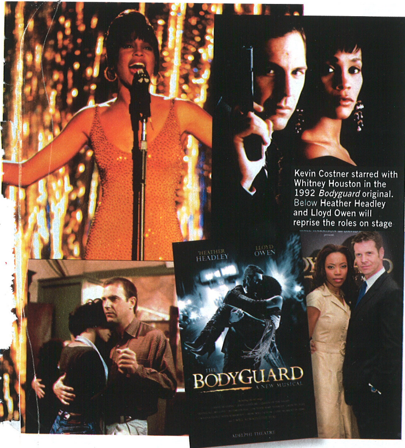
Kevin Costner starred with Whitney Houston in the 1992 Bodyguard original. Below Heather Headley and Lloyd Owen will reprise the roles on stage